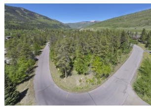
Listed by East Vail Team 5169 Gore Circle $1,250,000 - asking price Vacant lot with big views