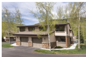
Sold by East Vail Team 23 Mountain Meadow $850,000 - sold price 3 bedrooms & attached garage