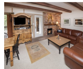
Under Contract by East Vail Team Vail Racquet Club 3 - 12 $615,000 - asking price 2 bedrooms on creek