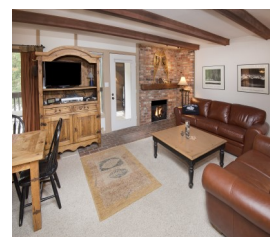
Under Contract by East Vail Team Vail Racquet Club 3-12 $615,000 - asking price 2 bedrooms & creek location