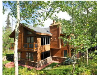
Sold by East Vail Team 5027 Ute Lane #B $1,400,000 - sold price 3 bedrooms & private location