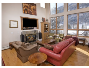
Sold by East Vail Team 4145 Spruce Way #B $1,090,000 - sold price 3 bedrooms & panoramic views