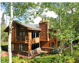
Sold by East Vail Team 5027 Ute Lane #B $1,400,000 - sold price 3 bedrooms & private location