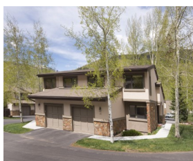
Listed by East Vail Team 23 Mountain Meadow $893,000 - asking price 3 bedrooms & 1-car attached garage