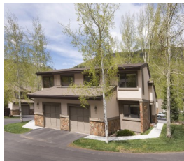
Listed by East Vail Team 23 Mountain Meadow $910,000 - asking price 3 bedrooms & attached garage