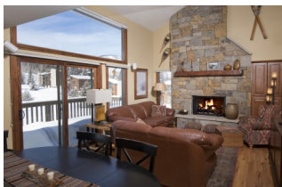
Listed by East Vail Team 910 Timber Falls $885,000 - asking price 3 bedrooms & gorgeous views