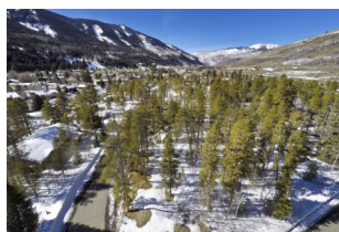
Listed by East Vail Team 5169 Gore Circle $1,350,000 - asking price Vacant lot with big views