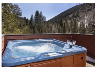
Under Contract by East Vail Team 4277 Columbine Drive $695,000 - asking price 2 bedrooms & mountain views