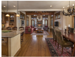
Under Contract by East Vail Team 4346 Spruce Way $2,275,000 - asking price 4 bedrooms & creek location