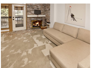
Under Contract by East Vail Team Vail Racquet Club Bldg. 2 Unit 3 $389,900 - asking price 1 bedrooms on Gore Creek