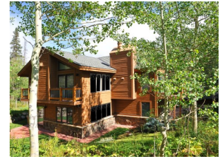
Under Contract by East Vail Team 5027 Ute Lane #B $1,454,000 - asking price 3 bedrooms & private location