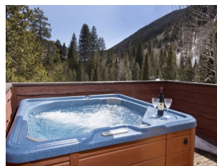
Under Contract by East Vail Team 4277 Columbine Drive $695,000 - asking price 2 bedrooms with mountain views