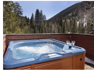
Under Contract by East Vail Team 4277 Columbine Drive $695,000 - asking price 2 bedrooms with mountain views