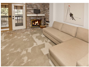
Under Contract by East Vail Team Vail Racquet Club Bldg. 2 Unit 3 $389,900 - asking price 1 bedrooms on Gore Creek