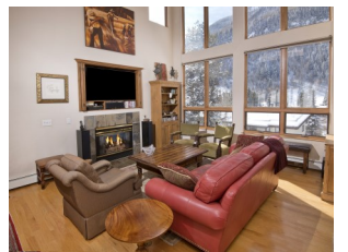
Under Contract by East Vail Team 4145 Spruce Way #B $1,199,000 - asking price 3 bedrooms & panoramic views