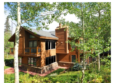
Listed by East Vail Team 5027 Ute Lane #B $1,454,000 - asking price 3 bedrooms & private location