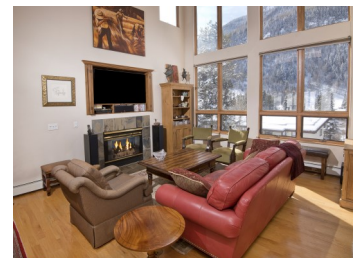
Listed by East Vail Team 4145 Spruce Way #B $1,199,000 - asking price 3 bedrooms & panoramic views