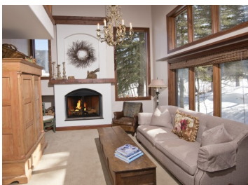
Sold by East Vail Team 18 Riverbend $1,100,000 - sold price 3 bedrooms & next to Bighorn Park