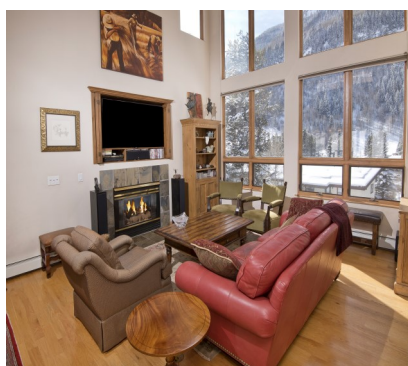
Listed by Jane 4145 Spruce Way #B $1,199,000 - asking price 3 bedroom & mountain views