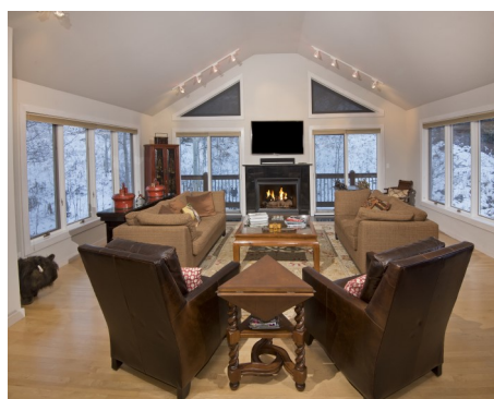
Listing by Jane & Under Contract 5027 Ute Lane #B $1,454,000 - asking price 3 bedrooms & fabulous views