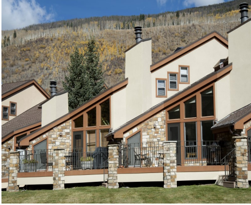
Listed by Jane Sundial B-4 $1,100,000 - sold price 3 bedrooms & 3 baths Located on Gore Creek

Jane sold 21 Vail area properties in 2016