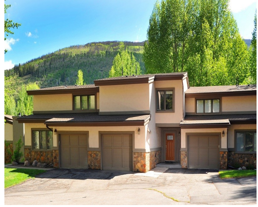
Listed by Jane & Under Contract 12 Mountain Meadow 3 bedrooms & 3 baths $900,000 - asking price 1-car attached garage