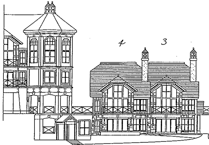
WEST ELEVATION - VILLAS D - C