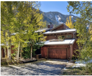
Listed by East Vail Team 4999 Main Gore Drive #A $1,385,000 - asking price 4 bedrooms & private location