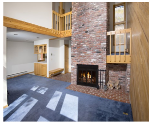
Listed by East Vail Team P-3 Racquet Club Townhome $765,000 - asking price 3 bedrooms & sunny location