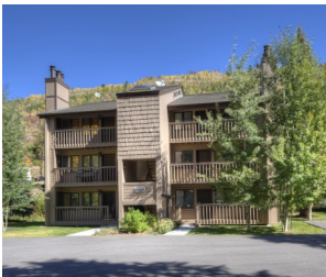
Under Contract by East Vail Team A-4 Bighorn Townhome $779,000 - asking price 3 bedrooms & mountain views