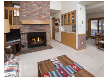
Listed by East Vail Team I-2 Racquet Club Townhome $699,000 - asking price 3 bedrooms & corner location