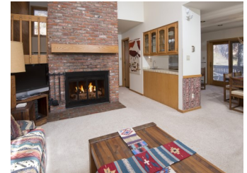
Listed by East Vail Team I-2 Racquet Club Townhome $699,000 - asking price 3 bedrooms & corner location