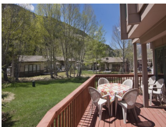
Under Contract by East Vail Team A-4 Bighorn Townhome $779,000 - asking price 3 bedrooms & mountain views