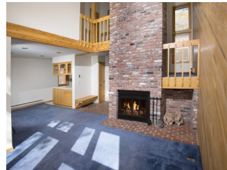
Listed by East Vail Team P-3 Racquet Club Townhome $765,000 - asking price 3 bedrooms & sunny location