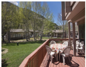
Under Contract by East Vail Team A-4 Bighorn Townhome $779,000 - asking price 3 bedrooms & mountain views