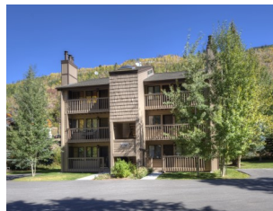
Under Contract by East Vail Team #10 Vail East Townhouse Condos $625,000 - asking price 3 bedrooms & mountain views