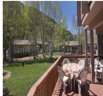
Under Contract by East Vail Team A-4 Bighorn Townhome $779,000 - asking price 3 bedrooms & mountain views