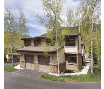
Sold by East Vail Team 23 Mountain Meadow $850,000 - sold price 3 bedrooms & attached garage