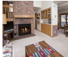
Listed by East Vail Team I-2 Racquet Club Townhome $699,000 - asking price 3 bedrooms & corner location