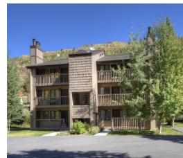
Under Contract by East Vail Team #10 Vail East Townhouse Condos $625,000 - asking price 3 bedrooms & mountain views