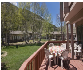
Under Contract by East Vail Team A-4 Bighorn Townhome $779,000 - asking price 3 bedrooms & mountain views