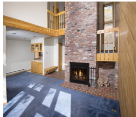
Listed by East Vail Team P-3 Racquet Club Townhome $765,000 - asking price 3 bedrooms & sunny location