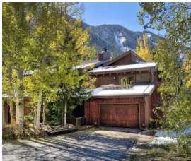
Listed by East Vail Team 4999 Main Gore Drive #A $1,385,000 - asking price 4 bedrooms & 2 car garage