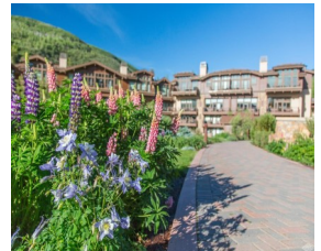
Under Contract by East Vail Team PU-1 Manor Vail Parking space $100,000 - asking price Covered, heated & ski locker