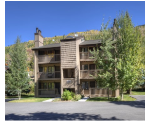
Under Contract by East Vail Team #10 Vail East Townhouse Condos $625,000 - asking price 3 bedrooms & mountain views