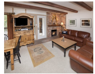
Under Contract by East Vail Team Vail Racquet Club 3-12 $615,000 - asking price 2 bedrooms on Gore Creek