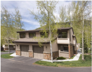
Sold by East Vail Team 23 Mountain Meadow $850,000 - sold price 3 bedrooms & attached garage