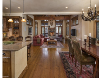
Sold by East Vail Team 4346 Spruce Way $2,146,000 - sold price 4 bedrooms & creek location