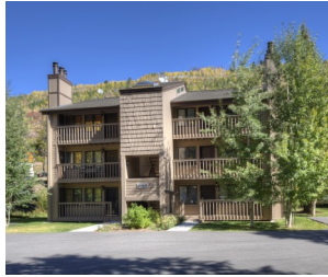
Under Contract by East Vail Team A-4 Bighorn Townhome $779,000 - asking price 3 bedrooms & mountain views