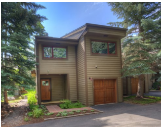
Listed by East Vail Team 44 Courtside $985,000- asking price 3 bedrooms & private setting