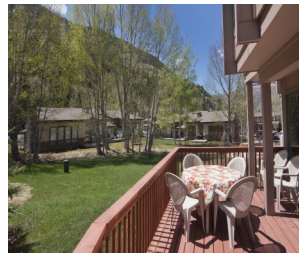
Under Contract by East Vail Team #10 Vail East Townhouse Condos $625,000- asking price 3 bedrooms & mountain views