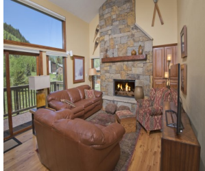
Sold by East Vail Team 910 Timber Falls $849,000 - sold price 3 bedrooms & gorgeous views