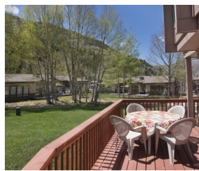
Under Contract by East Vail Team A-4 Bighorn Townhome $779,000 - asking price 3 bedrooms & mountain views