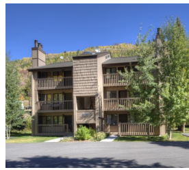
Under Contract by East Vail Team #10 Vail East Townhouse Condos $625,000 - asking price 3 bedrooms & mountain views