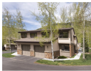
Sold by East Vail Team 23 Mountain Meadow $850,000 - sold price 3 bedrooms & attached garage