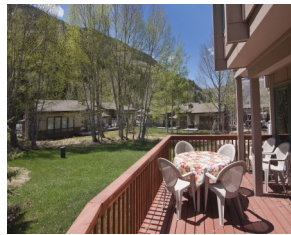
Under Contract by East Vail Team A-4 Bighorn Townhome $779,000 - asking price 3 bedrooms & mountain views