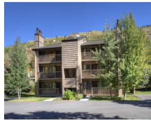
Under Contract by East Vail Team #10 Vail East Townhouse Condos $625,000 - asking price 3 bedrooms & mountain views