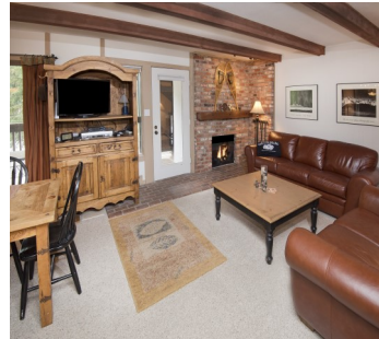
Under Contract by East Vail Team Vail Racquet Club Building 3 Unit 12 $615,000 - asking price 2 bedrooms on creek