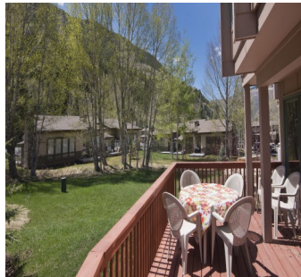
Under Contract by East Vail Team A-4 Bighorn Townhome $779,000 - asking price 3 bedrooms & mountain views