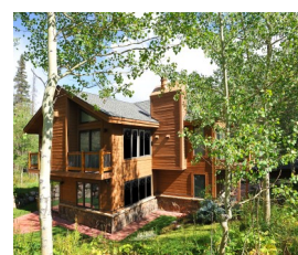
Sold by East Vail Team 5027 Ute Lane #B $1,400,000 - sold price 3 bedrooms & private location