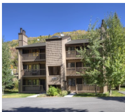
Under Contract by East Vail Team #10 Vail East Townhouse Condos $625,000 - asking price 3 bedrooms & mountain views