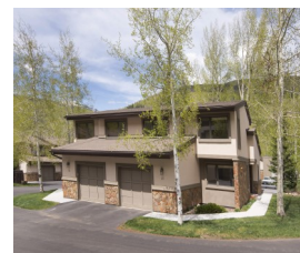
Sold by East Vail Team 23 Mountain Meadow $850,000 - sold price 3 bedrooms & attached garage