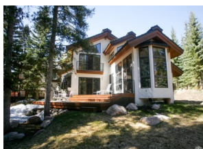
Sold by East Vail Team 4266 Columbine Drive $2,250,000 - sold price 4 bedrooms on Gore Creek