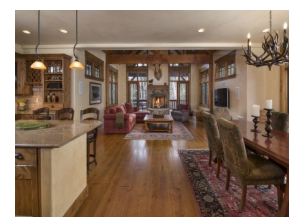
Sold by East Vail Team 4346 Spruce Way $2,146,000 - sold price 4 bedrooms & creek location