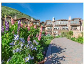
Listed by East Vail Team PU-1 Manor Vail parking space $100,000 - asking price Covered, heated and ski locker