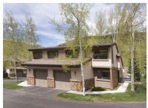
Sold by East Vail Team 23 Mountain Meadow $850,000 - sold price 3 bedrooms & attached garage