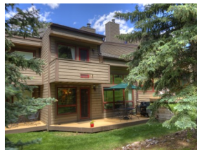
Sold by East Vail Team 38 Courtside $1,100,000 - sold price 3 bedrooms & private setting