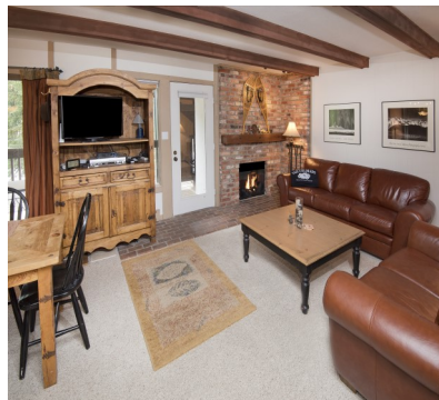
Under Contract by East Vail Team Vail Racquet Club Building 3 Unit 12 2 bedrooms & creek location $615,000 - asking price