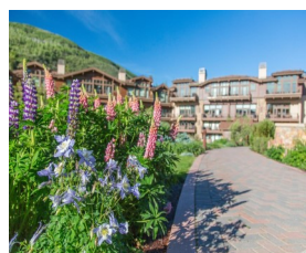
Listed by East Vail Team PU-1 Manor Vail parking space $130,000 - asking price Covered, heated and ski locker