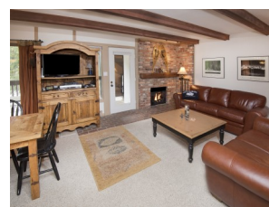
Under Contract by East Vail Team Vail Racquet Club 3-12 $615,000 - asking price 2 bedrooms & creek location