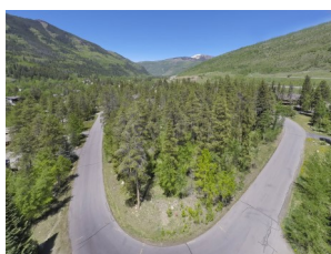
Listed by East Vail Team 5169 Gore Circle $1,250,000 - asking price Vacant lot with big views