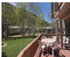
Listed by East Vail Team A-4 Bighorn Townhome $798,900 - asking price 3 bedrooms & mountain views