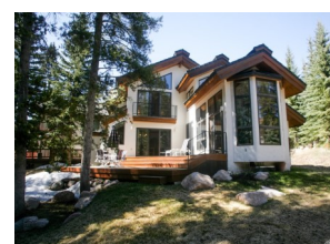
Sold by East Vail Team 4266 Columbine Drive $2,250,000 - sold price 4 bedrooms on Gore Creek