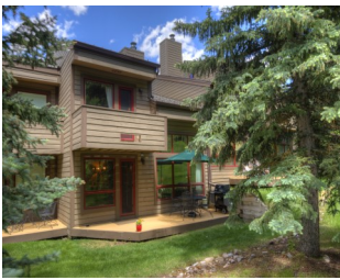
Under Contract by East Vail Team 38 Courtside $1,150,000 - asking price 3 bedrooms & private setting