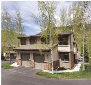
Under Contract by East Vail Team 23 Mountain Meadow 3 bedrooms & 1 car attached garage $893,000 - asking price