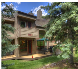
Under Contract by East Vail Team 38 Courtyard $1,150,000 - asking price 3 bedrooms & private setting