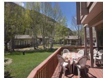
Listed by East Vail Team A-4 Bighorn Townhome $798,900 - asking price 3 bedrooms & mountain views