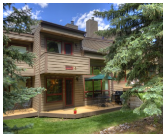
Under Contract by East Vail Team 38 Courtside $1,150,000 - asking price 3 bedrooms & private settings