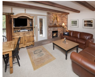
Listed by East Vail Team Vail Racquet Club 3 - 12 2 bedrooms on Gore Creek $615,000 - asking price