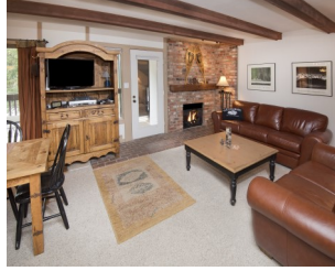
Listed by East Vail Team Vail Racquet Club 3 - 12 2 bedrooms on Gore Creek $615,000 - asking price