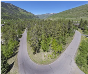
Listed by East Vail Team 5169 Gore Circle $1,250,000 - asking price Vacant lot with big views