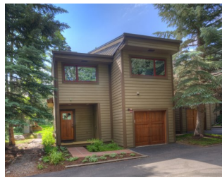
Listed by East Vail Team 44 Courtside $1,049,000 - asking price 3 bedrooms & private setting