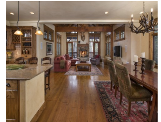
Sold by East Vail Team 4346 Spruce Way $2,146,000 - sold price 4 bedrooms & creek location