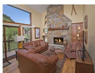
Under Contract by East Vail Team 910 Timber Falls $885,000 - asking price 3 bedroom & gorgeous views