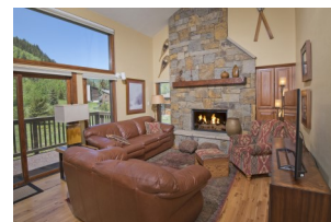
Under Contract by East Vail Team 910 Timber Falls $885,000 - asking price 3 bedrooms & gorgeous views