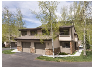
Listed by East Vail Team 23 Mountain Meadow $893,000 - asking price 3 bedrooms & attached garage