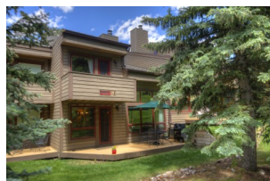
Listed by East Vail Team 38 Courtside $1,150,000 - asking price 3 bedrooms & private setting