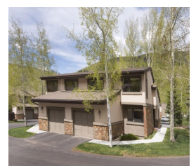
Listed by East Vail Team 23 Mountain Meadow $893,000 - asking price 3 bedrooms & attached garage