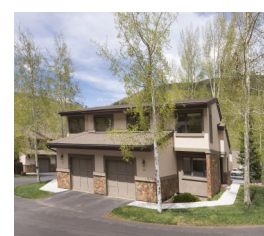
Listed by East Vail Team 23 Mountain Meadow $893,000 - asking price 3 bedrooms & attached garage