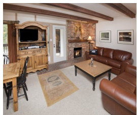
Listed by East Vail Team Vail Racquet Club 3-12 $615,000 - asking price 2 bedrooms creek location