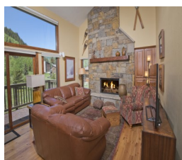
Under Contract by East Vail Team 910 Timber Falls $885,000 - asking price 3 bedrooms & gorgeous views