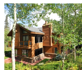
Sold by East Vail Team 5027 Ute Lane #B $1,400,000 - sold price 3 bedrooms & private location