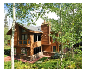
Sold by East Vail Team 5027 Ute Lane #B $1,400,000 - sold price 3 bedrooms & private location