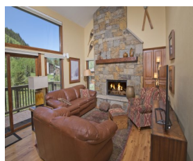
Under Contract by East Vail Team 910 Timber Falls $885,000 - asking price 3 bedrooms & gorgeous views