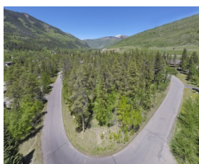
Listed by East Vail Team 5169 Gore Circle $1,250,000 - asking price Vacant lot with big views