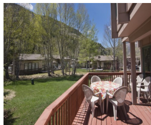
Listed by East Vail Team A-4 Bighorn Townhome $819,900 - asking price 3 bedrooms & mountain views