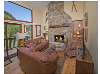
Under Contract by East Vail Team 910 Timber Falls $885,000 - asking price 3 bedrooms & gorgeous views