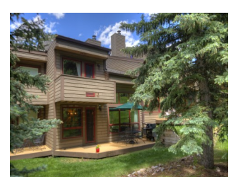
Listed by East Vail Team 38 Courtside 3 bedrooms & private setting $1,150,000 - asking price