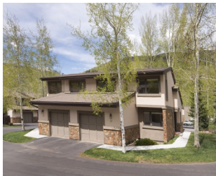
Listed by East Vail Team 23 Mountain Meadow $893,000 - asking price 3 bedrooms & attached garage