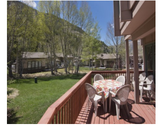
Listed by East Vail Team A-4 Bighorn Townhome $819,900 - asking price 3 bedrooms & mountain views