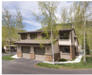
Listed by East Vail Team 23 Mountain Meadow $893,000 - asking price 3 bedrooms & attached garage