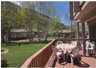
Listed by East Vail Team A-4 Bighorn Townhome $819,900 - asking price 3 bedrooms & mountain views