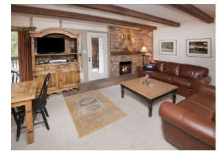
Listed by East Vail Team VRC Building 3 - Residence 12 $615,00 - asking price 2 bedroom creek location