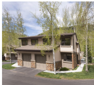
Listed by East Vail Team 23 Mountain Meadow 3 bedrooms & 1 car attached garage $893,000 - asking price