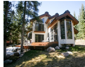
Sold by East Vail Team 4266 Columbine Drive $2,250,000 - sold price 4 bedrooms on Gore Creek