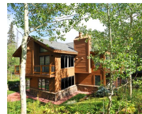
Sold by East Vail Team 5027 Ute Lane #B $1,400,000 - sold price 3 bedrooms & private location