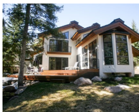
Sold by East Vail Team 4266 Columbine Drive $2,250,000 - sold price 4 bedrooms on Gore Creek