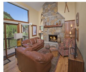
Under Contract by East Vail Team 910 Timber Falls $885,000 - asking price 3 bedrooms & gorgeous views