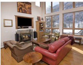
Sold by East Vail Team 4145 Spruce Way #B $1,090,000 - sold price 3 bedrooms & panoramic views