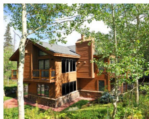
Sold by East Vail Team 5027 Ute Lane #B $1,400,000 - sold price 3 bedrooms & private location