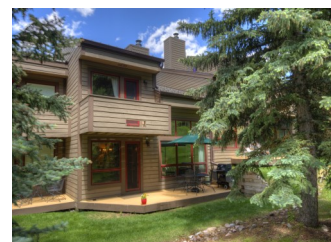
Under Contract by East Vail Team 38 Courtyard $1,150,000 - asking price 3 bedrooms & private settings