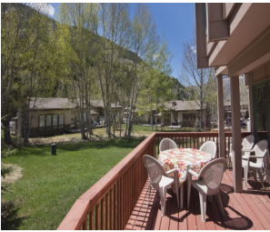
Listed by East Vail Team A-4 Bighorn Townhome $819,900 - asking price 3 bedrooms & mountain views