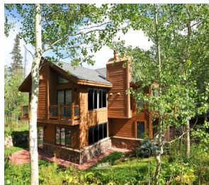
Sold by East Vail Team 5027 Ute Lane #B $1,400,000 - sold price 3 bedrooms & private location