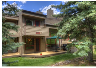
Under Contract by East Vail Team 38 Courtside $1,150,000 - asking price 3 bedrooms & private setting