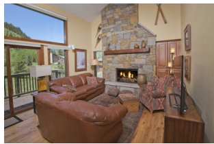
Under Contract by East Vail Team 910 Timber Falls $885,000 - asking price 3 bedrooms & gorgeous views