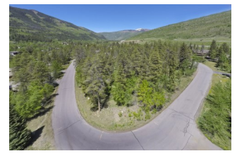
Listed by East Vail Team 5169 Gore Circle $1,250,000 - asking price Vacant lot with big views