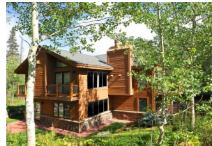
Sold by East Vail Team 5027 Ute Lane #B $1,400,000 - asking price 3 bedrooms & private location