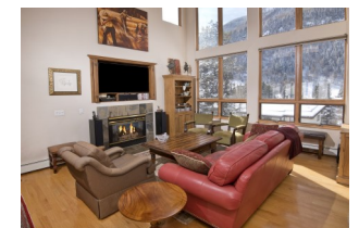
Sold by East Vail Team 4145 Spruce Way #B $1,090,000 - sold price 3 bedrooms & panoramic views