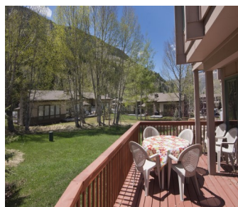
Listed by East Vail Team A-4 Bighorn Townhome 3 bedrooms & mountain views $819,900 - asking price