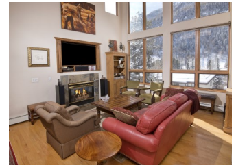
Under Contract by East Vail Team 4145 Spruce Way #B $1,199,000 - asking price 3 bedrooms & panoramic views