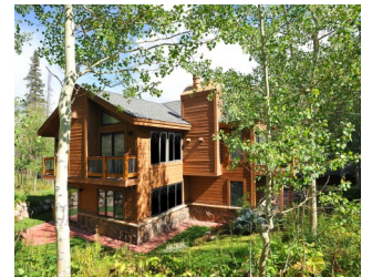
Under Contract by East Vail Team 5027 Ute Lane #B $1,454,000 - asking price 3 bedrooms & private location