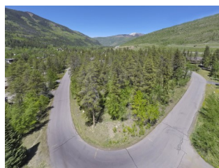
Listed by East Vail Team 5169 Gore Circle $1,350,000 - asking price Vacant lot with big views