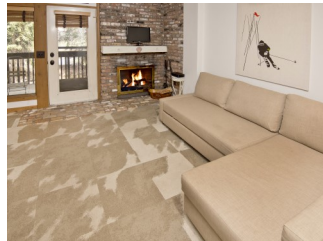
Under Contract by East Vail Team Vail Racquet Club Bldg. 2 Unit 3 $389,900 - asking price 1 bedroom on Gore Creek