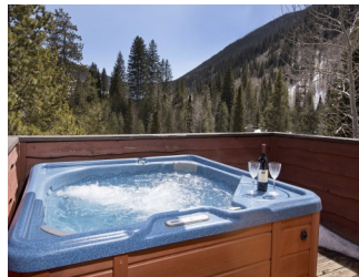
Sold by East Vail Team 4277 Columbine Drive $675,000 - asking price 2 bedrooms & mountain views