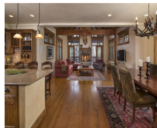
Under Contract by East Vail Team 4346 Spruce Way $2,275,000 - asking price 4 bedrooms & creek location