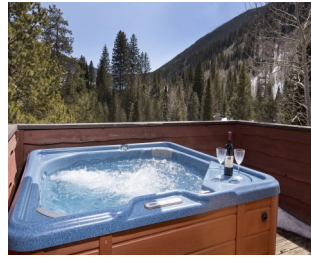
Sold by East Vail Team 4277 Columbine Drive $675,000 - sold price 2 bedrooms & mountain views