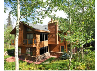
Under Contract by East Vail Team 5027 Ute Lane #B $1,454,000 - asking price 3 bedrooms & private location