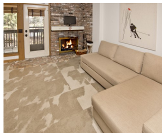
Under Contract by East Vail Team Vail Racquet Club Bldg. 2 Unit 3 $389,900 - asking price 1 bedroom on Gore Creek