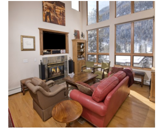
Under Contract by East Vail Team 4145 Spruce Way #B $1,199,000 - asking price 3 bedrooms & panoramic views