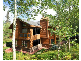
Under Contract by East Vail Team 5027 Ute Lane #B $1,454,000 - asking price 3 bedrooms & private location