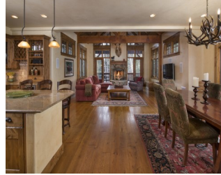
Under Contract by East Vail Team 4346 Spruce Way $2,275,000 - asking price 4 bedrooms & creek location