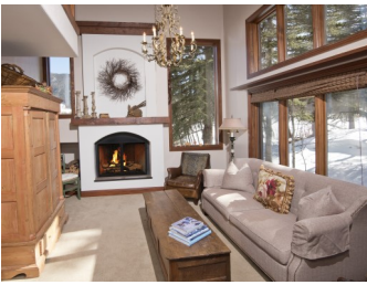
Listed & Sold by East Vail Team 18 Riverbend $1,100,000 - sold price 3 bedrooms & next to Bighorn Park