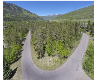
Listed by East Vail Team 5169 Gore Circle $1,350,000 - asking price Vacant lot with big views