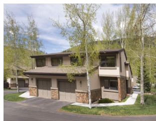
Listed by East Vail Team 23 Mountain Meadow $910,000 - asking price 3 bedrooms & attached garage