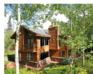
Under Contract by East Vail Team 5027 Ute Lane #B $1,454,000 - asking price 3 bedrooms & private location