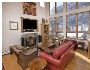
Under Contract by East Vail Team 4145 Spruce Way #B $1,199,000 - asking price 3 bedrooms & panoramic views