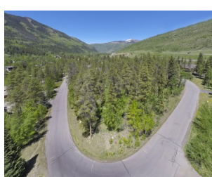
Listed by East Vail Team 5169 Gore Circle $1,350,000 - asking price Vacant lot with big views