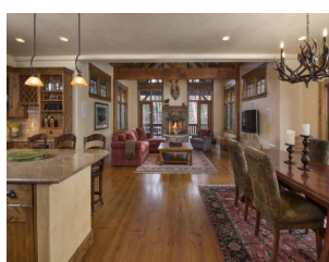
Under Contract by East Vail Team 4346 Spruce Way $2,275,000 - asking price 4 bedrooms & creek location