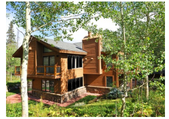
Under Contract by East Vail Team 5027 Ute Lane #B $1,454,000 - asking price 3 bedrooms & private location