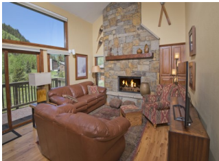
Listed by East Vail Team 910 Timber Falls $885,000 - asking price 3 bedroom & gorgeous views