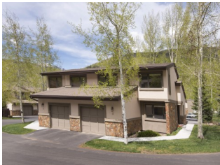
Listed by East Vail Team 23 Mountain Meadow 3 bedrooms & 1 car attached garage $910,000 - asking price