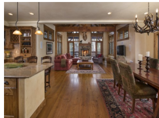
Under Contract by East Vail Team 4346 Spruce Way $2,275,000 - asking price 4 bedrooms & creek location