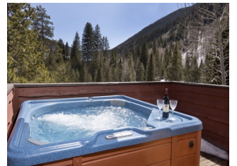
Sold by East Vail Team 4277 Columbine Drive $675,000 - sold price 2 bedroom & mountain views