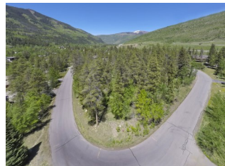
Listed by East Vail Team 5169 Gore Circle $1,350,000 - asking price vacant lot with big views