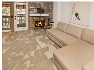
Under Contract by East Vail Team Vail Racquet Club Bldg. 2 Unit 3 $389,900 - asking price 1 bedroom on Gore Creek